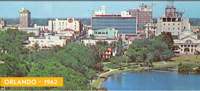
ORLANDO - 1962

The Downtown Orlando Historic District has been officially designated by the Orlando City Council and the City of Orlando’s Historic Preservation Board. The Historic Preservation Board consists of nine members appointed by the Mayor and confirmed by the City Council. The board and its committees review all projects and development within the City’s six historic districts and all landmarked properties.