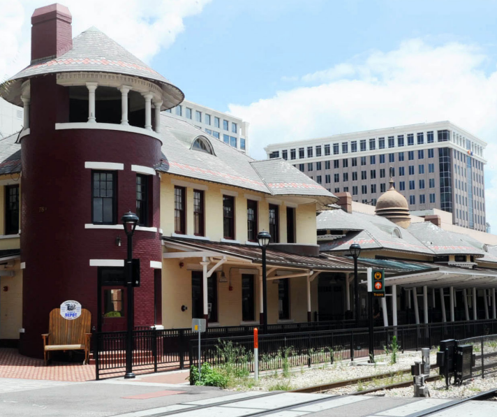
Buddy Dyer, Orlando Mayor